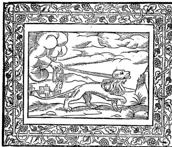
Figure 5: The lion's power in the world of the living. Society is shown in the background as houses, churches, etc. Notice that a power from above keeps the lion under control. This tells the magician how to work with that lion power without it getting out of control: it is divinely led and controlled. Remember that the lion is both angelic and a deity...keep that in mind.