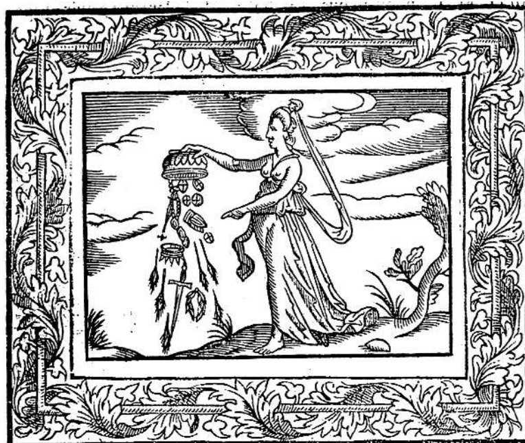
Figure 7: A goddesses' power on the land. Think about her left hand and what she is doing, and about her right hand and what is going on there. Think about weighing, harvests, and composting.