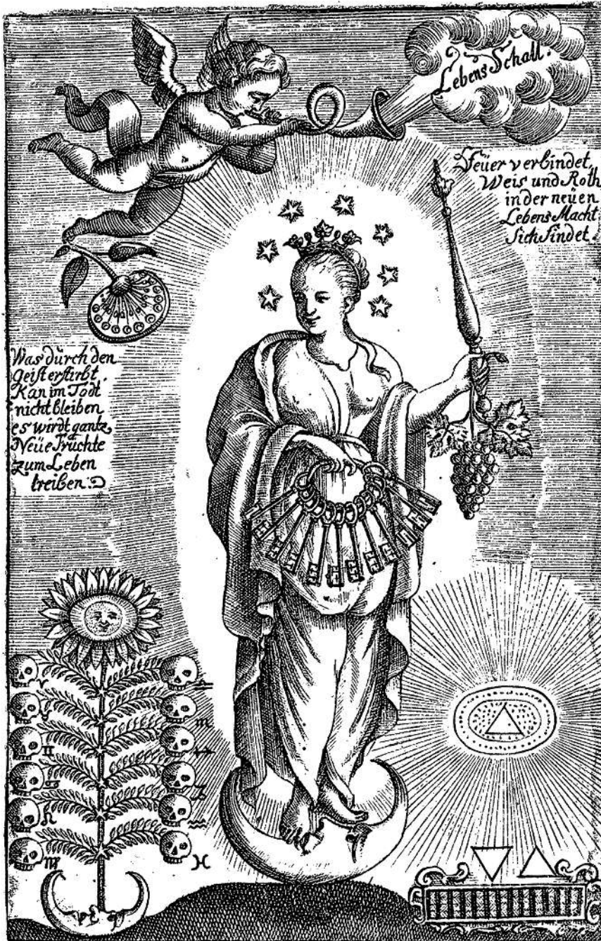
Figure 9: Second image for analysis