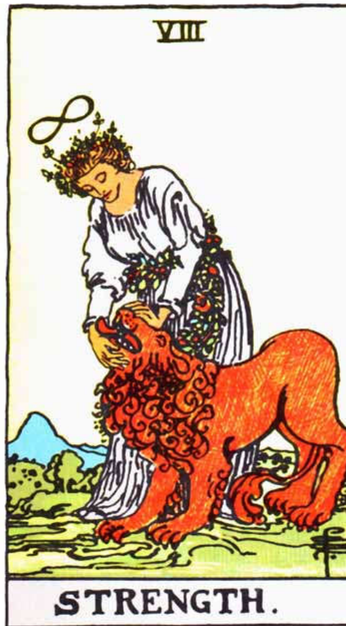
Figure 1: Strength , from the Rider Waite deck.

Rider Waite tarot card, a fairly modern image, and work back from there.