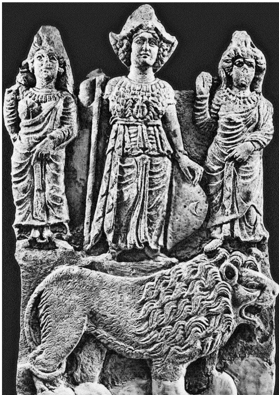
Figure 3: Al-Uzza, Allat, and Manah/Manat