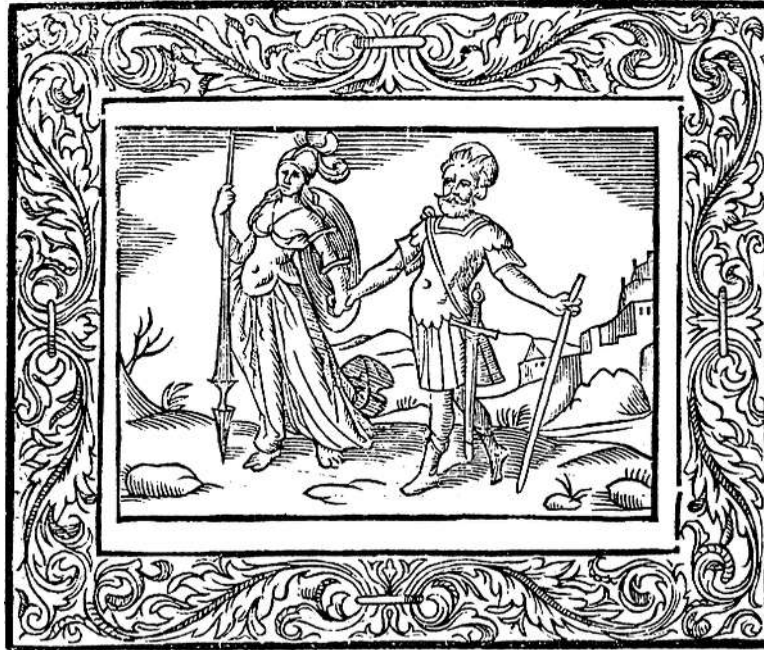
Figure 6: The king and the goddess of the land: the sacred kingship. Note the tools' positions: which are held, and which are not? Note the positions of the feet, and which leg is forward. Also notice which hand the goddess is holding. Think about the message in this. It is advice to a leader on how to govern well on the sacred land.