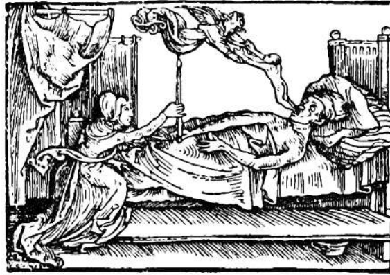
Figure 4: Death dynamics: look at the man's right side. There is no wall or curtain: it is the gate to death from the right, which is also where the angel comes from. Notice which side the woman holds the baton, and where her left hand is: by his feet. Notice too that the woman's baton touches the angel: think about that. This image is telling the magician the basic dynamics of death from a ritual/magical perspective.