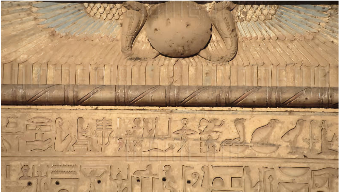
Figure 1: Nekhbet and Wadjet

An adoration of Ra who rises on the horizon, when he makes his ba, the visible form of his soul, rise like a powerful ghost from the underworld. The shining spectre of Ra that is our physical sun, when he raises himself, rejoicing in the power of his ka. An adoration of Ra, his ba, and his ka, when he has the sun-boat's steersman cast off from the east and head out into deep sky while addressed in these words by the Osiris adept: